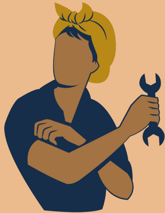
Barter and trade networks