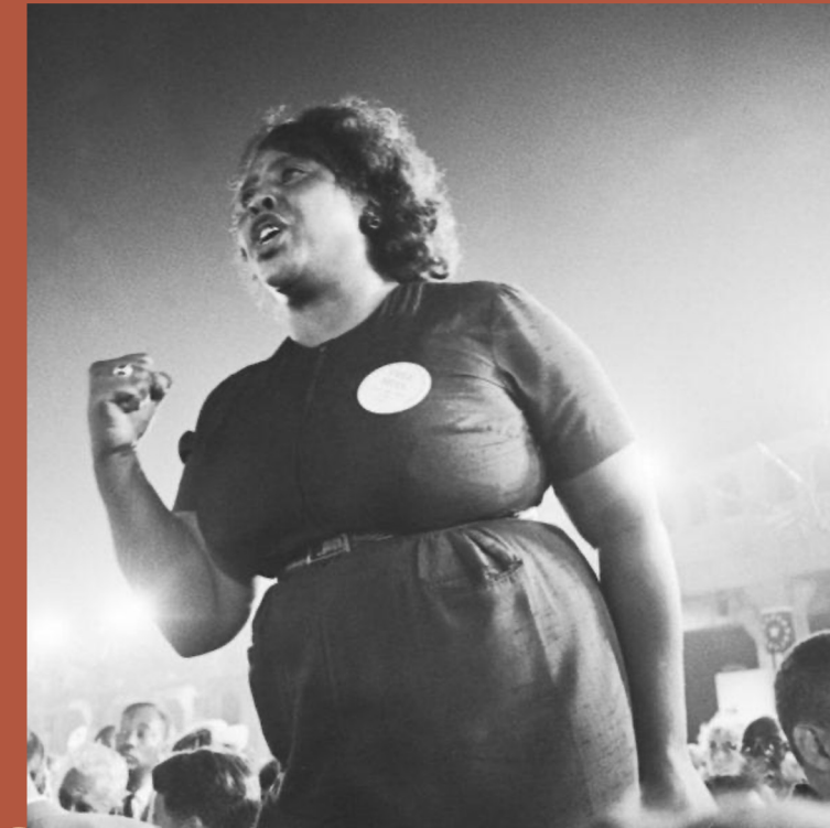
Fannie Lou Hamer, civil rights activist, founder of Freedom Farm Co- operative

"No one is free until everybody is free"