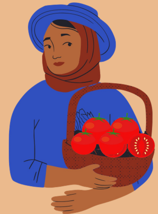
Emergency Food and Community Supported Agriculture