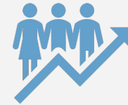
Not For Profit